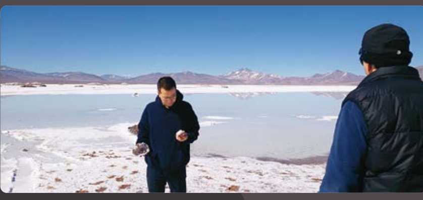
Inspection at Maricunga salt flat