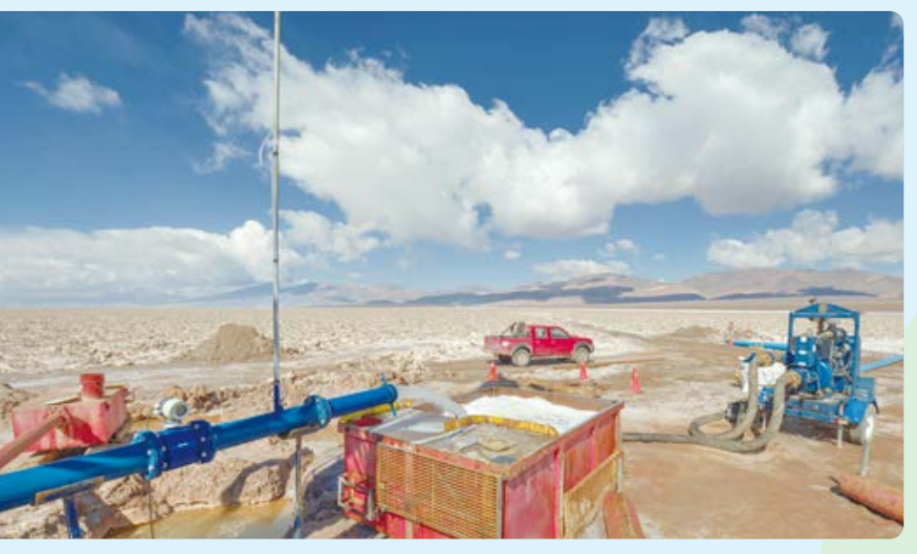
Extraction of lithium components from the groundwater beneath the massive salt flat